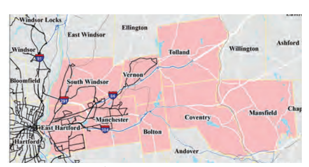
CTfastrak East Study Area

A service plan will be developed through the course of this study. Some possible connections include: