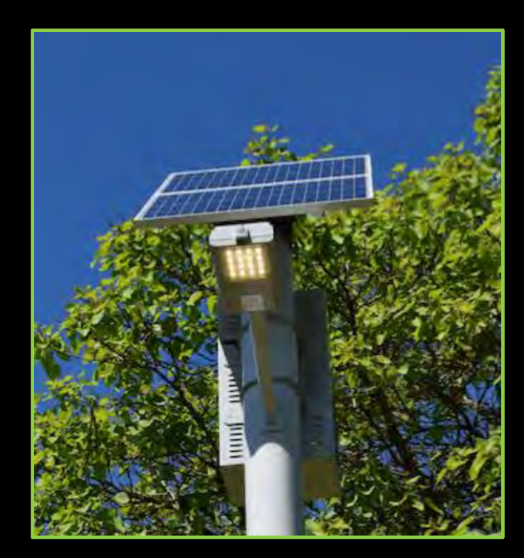
Solar Powered Lighting